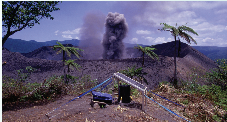
NEAR-FIELD INFRASOUND EXPERIMENT DURING YASUR ERUPTION

namely the presentation at the European Geophysical Union (EGU) in April 2012, as well as presentations to EGU scientific sessions this year. ARISE has also published findings in internationally peer-reviewed journals, and further publications are set to emerge. Another key tool for communicating findings is through the ARISE workshops that focus on some of the main topics for the networks. These are well attended by participants from many different countries, as are the training school events. Furthermore, information provided on the dedicated project website helps to support debate about the efforts and relevant scientific topics.